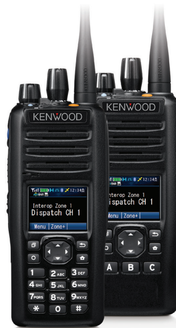
Full-Keypad & Standard Models